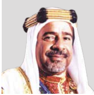
Late Amir His Highness Shaikh Isa bin Salman Al Khalifa