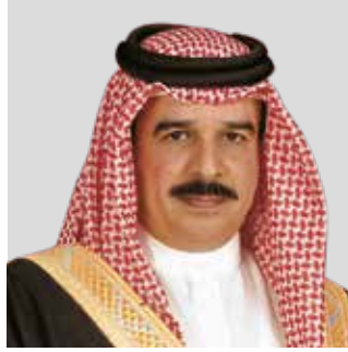
His Majesty King Hamad bin Isa Al Khalifa