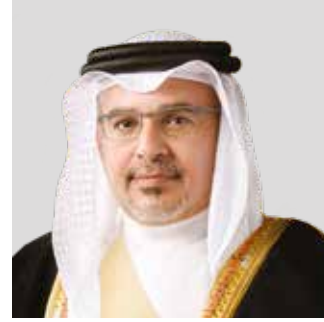
His Royal Highness Prince Salman bin Hamad Al Khalifa

The Crown Prince and Prime Minister of the Kingdom of Bahrain