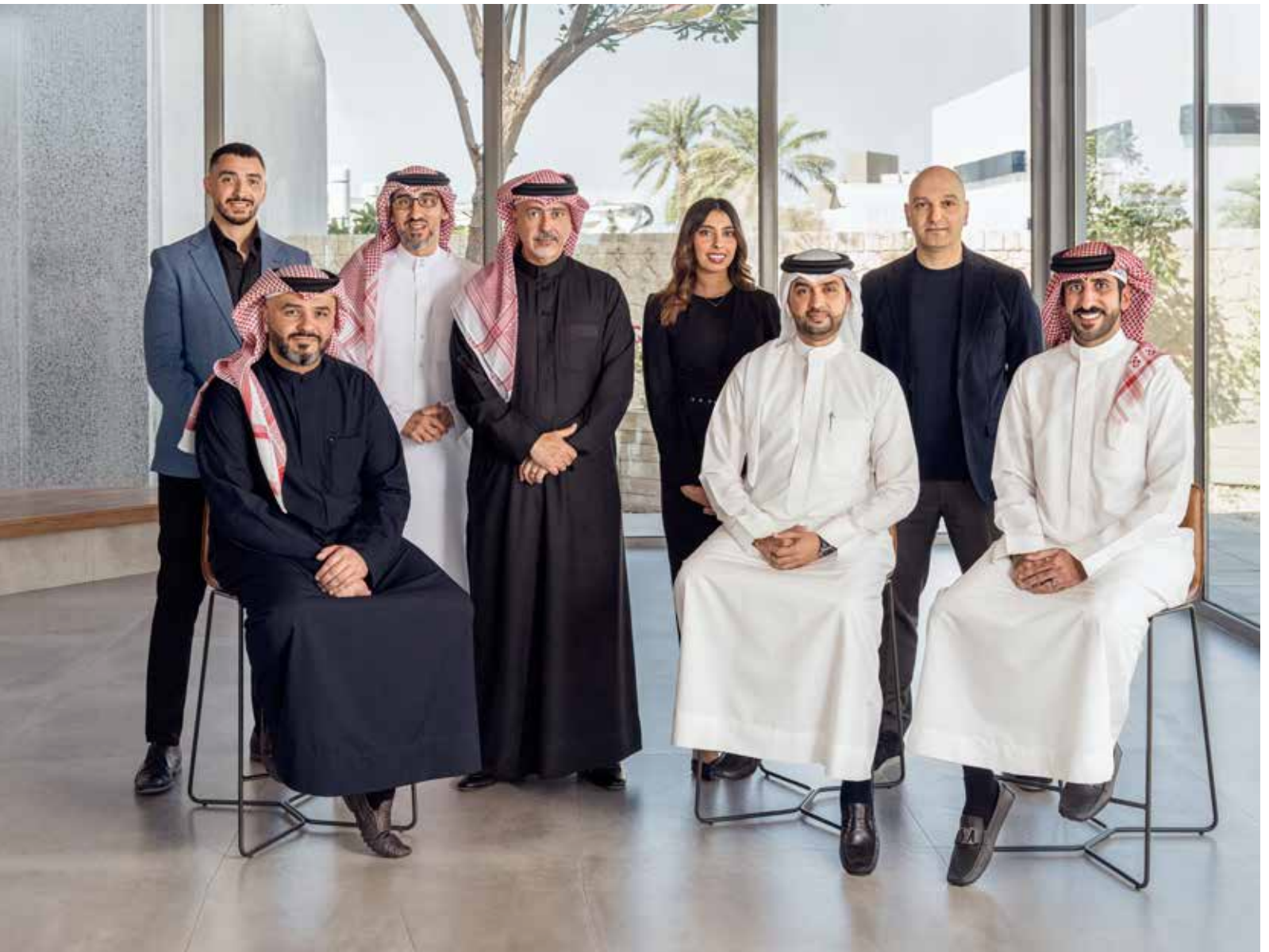
The Beyon Sustainability Committee represents: Batelco, Beyon Money, Beyon Cyber, Beyon Connect and Beyon Solutions.